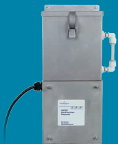
Prizefighter Automatic Touchless Dispenser System AD10022