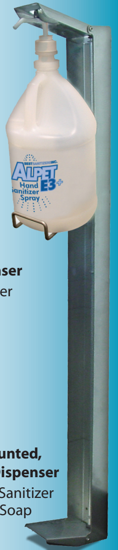
EZ Step Wall-Mounted, Foot Activated Dispenser MD10105 - Hand Sanitizer MD10110 - Foam Soap

Please use of the following Sanitizer or Foam Soap gallon refills with these dispensing systems: