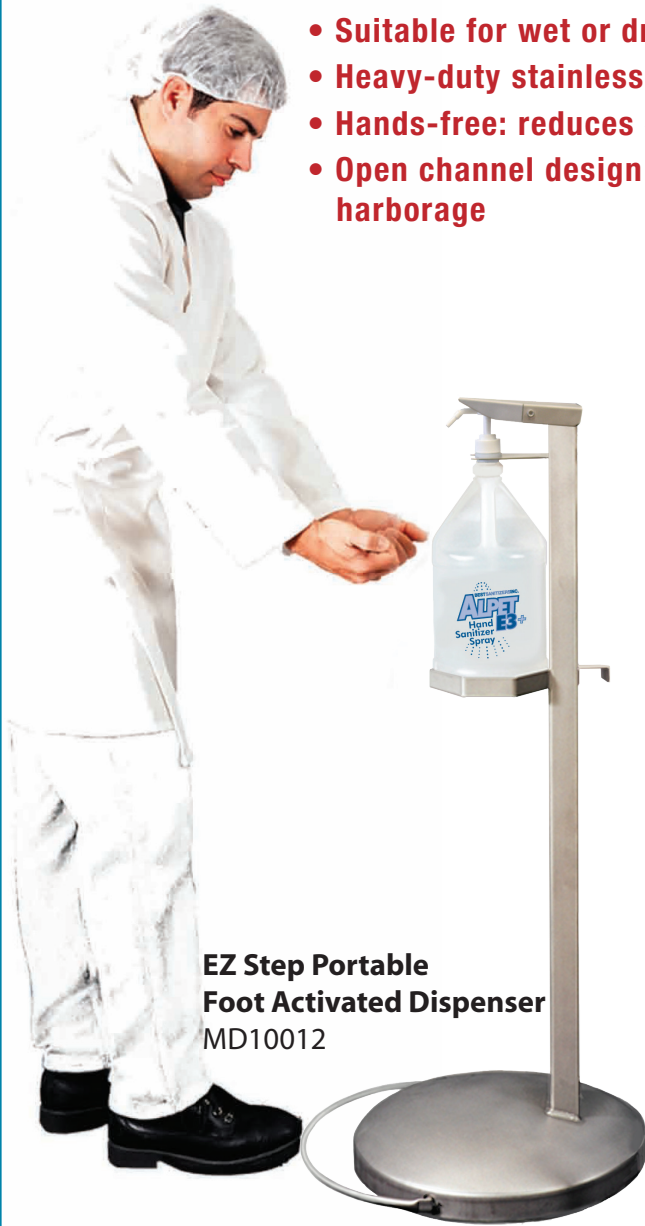
EZ Step Portable Foot Activated Dispenser MD10012