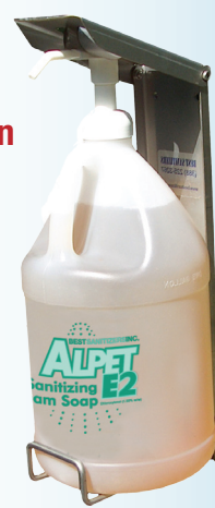
1-2 Knockout Wrist Activated Dispenser MD10006 - Hand Sanitizer MD10003 - Foam Soap